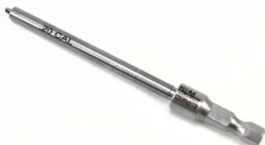
UP20STD UP17STD Professional Flash Hole Uniformers, .17 and .20 cal.