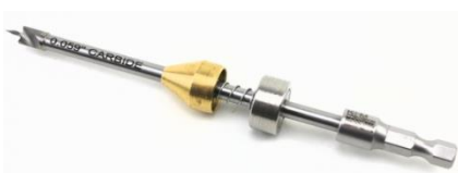
FLPCRB059P FLPCRB062P FLPCRB082P Premium Carbide Flash Hole Uniformers