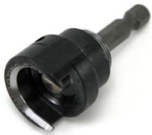
CHPA50 .50 BMG Power Adapter