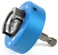
CHPA Power Adapter with Power Grip