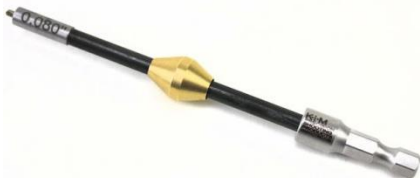
UPSTD080 UPPPC062 Professional Flash Hole Uniformers, .080" and .062